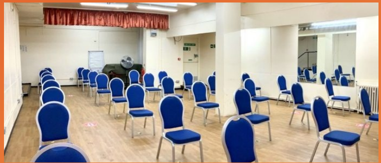
Lecture & Conference hall