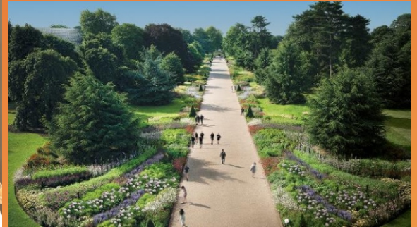
Herbal Garden Royal Botanic Gardens, Kew