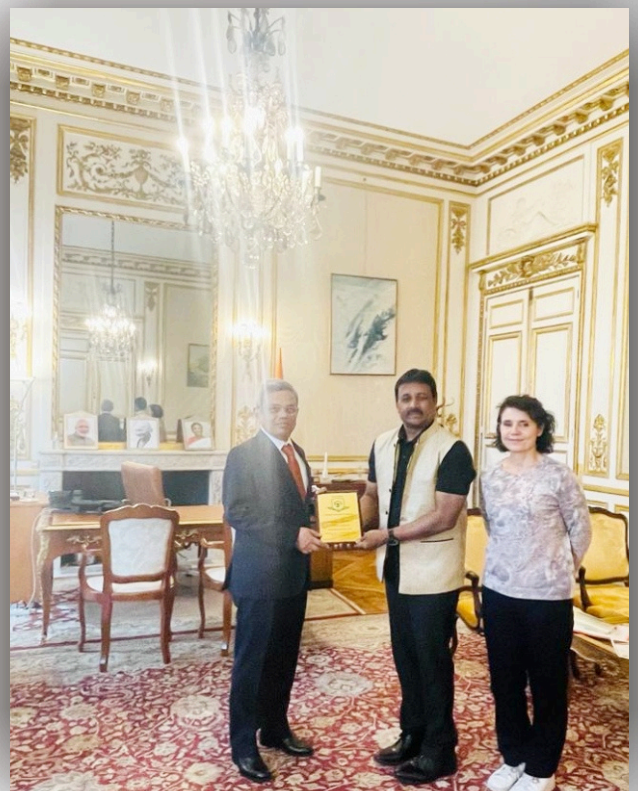
With Indian Ambassador to France