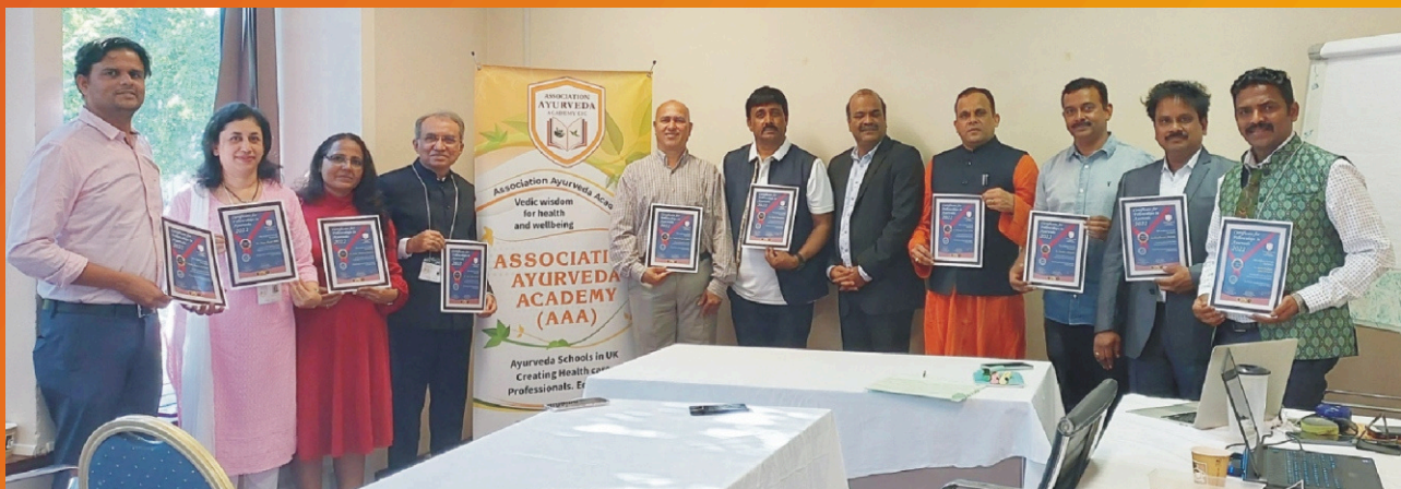
FBAA Students with Certificates, London