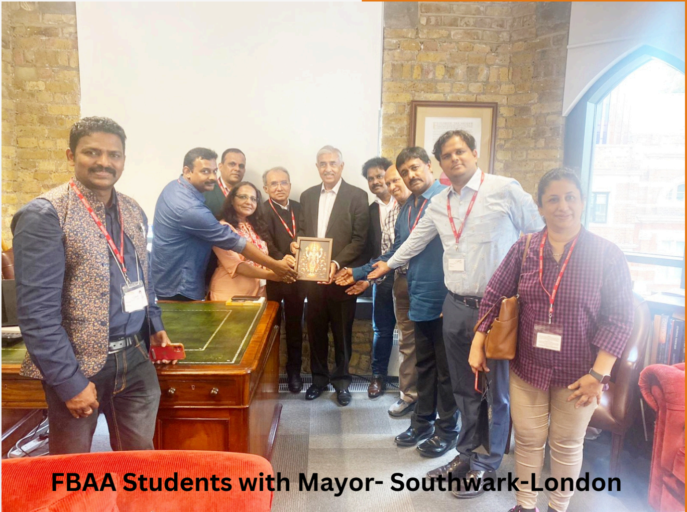
FBAA Students with Mayor- Southwark-London

FELLOWSHIP OF BRITISH AYURVEDA ACADEMY, UK ASSOCIATION.