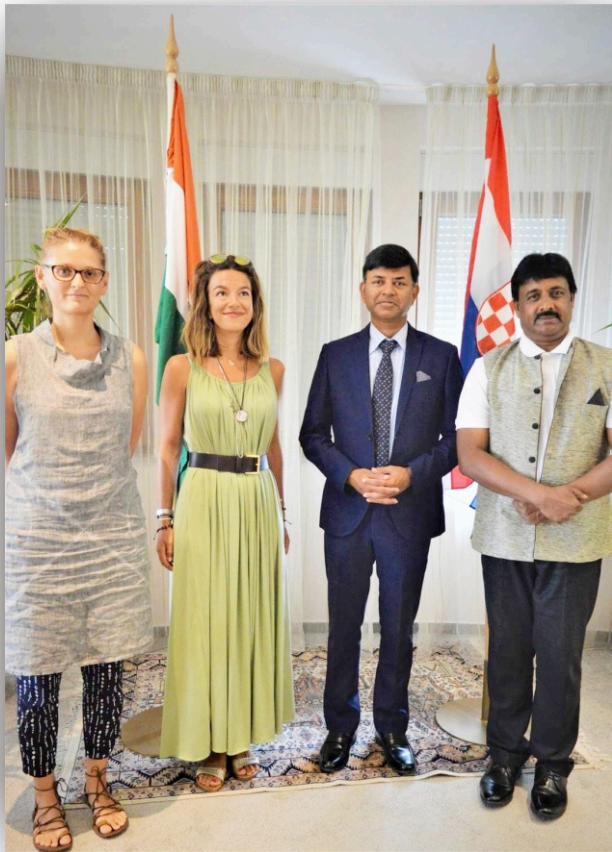
With Indian Ambassador to Croatia