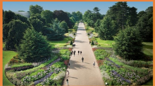
Herbal Garden Royal Botanic Gardens, Kew