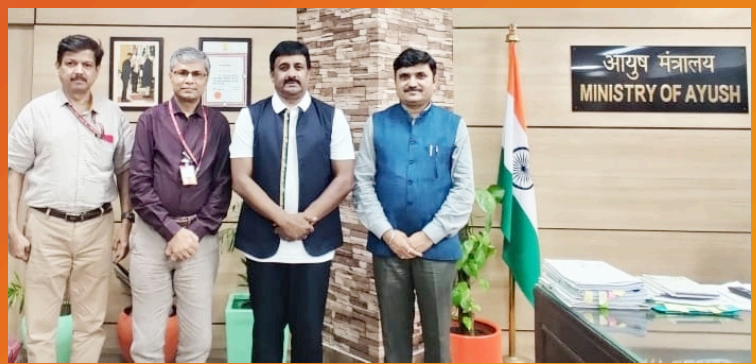
With Secretary-Ministry of Ayush, Govt. Of India